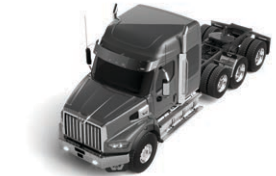
72" Stratosphere High Roof Available in Mid Roof