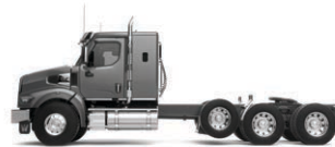
36" Trench-Style Low Roof Available in Mid Roof