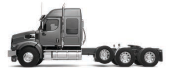
48" Mid Roof