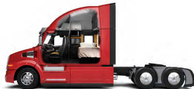
72" Stratosphere High Roof

The ergonomic dash with digital interface features an easy-to-read and customizable layout that gives you the data you need at a glance, with integrated steering wheel controls that let you change vehicle information and entertainment settings without your hands ever leaving the wheel.