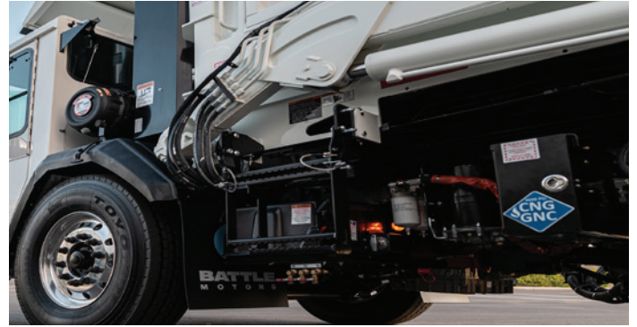
Fuel Management Module (FMM) integrated into all BTC and saddle mount systems NGV-1 and Transit Quick Connect Fuel Fill Connections located in FMM Factory installed, warranted, and supported CNG systems in both BTC and saddle mount configurations from 45 DGE to 75 DGE