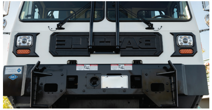
Front bumper fill connections available