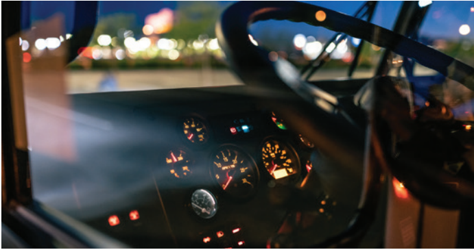
Conventional dash mounted fuel level gauge, standard with low level warning light